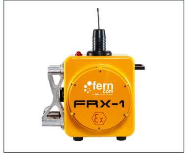
FRX-1 ATEX Portable Repeater