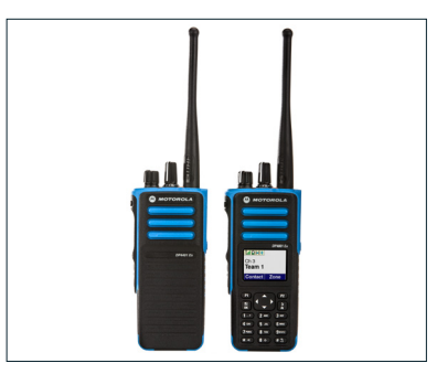
ATEX Motorola Handheld Radio