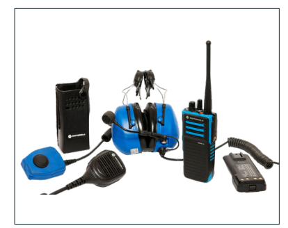
ATEX Hire Pack